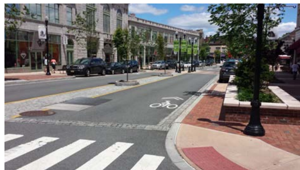
Montclair, NJ Sharrow Lane

The Committee formed in a response to the need for reduced pedestrian and cyclist crashes in the community. Since its formation in 2013, the committee has launched a "Drive with Care in Montclair" campaign, created banners and flyers, participated in a televised forum, and has built partnerships with town stakeholders such as Bike and Walk Montclair, Montclair Engineers, Partners for Health Foundation, and the Senior Citizens Advisory Council.