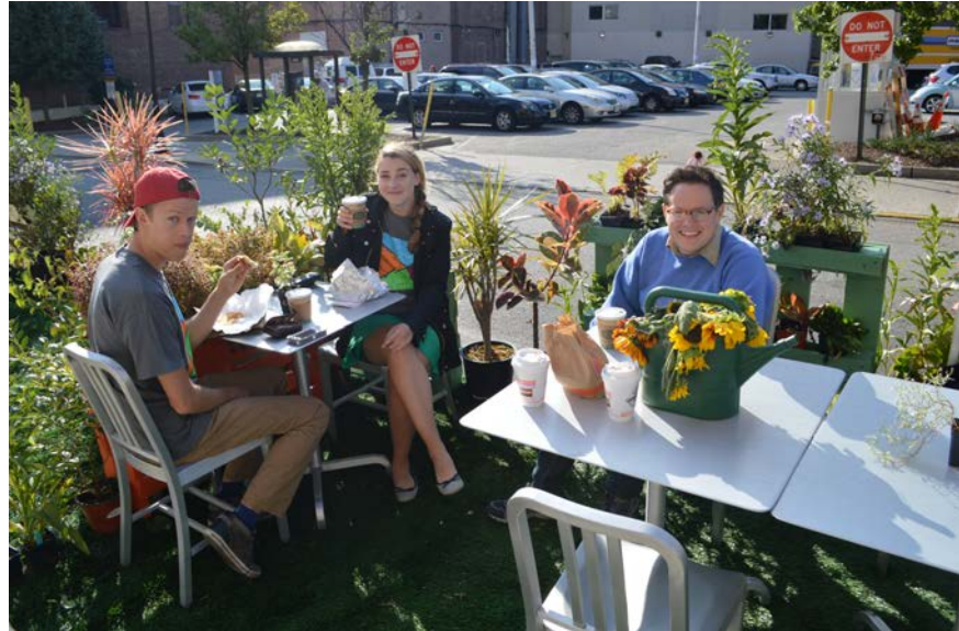
New Brunswick, NJ Parking Day

To read the full Together North Jersey article click here .