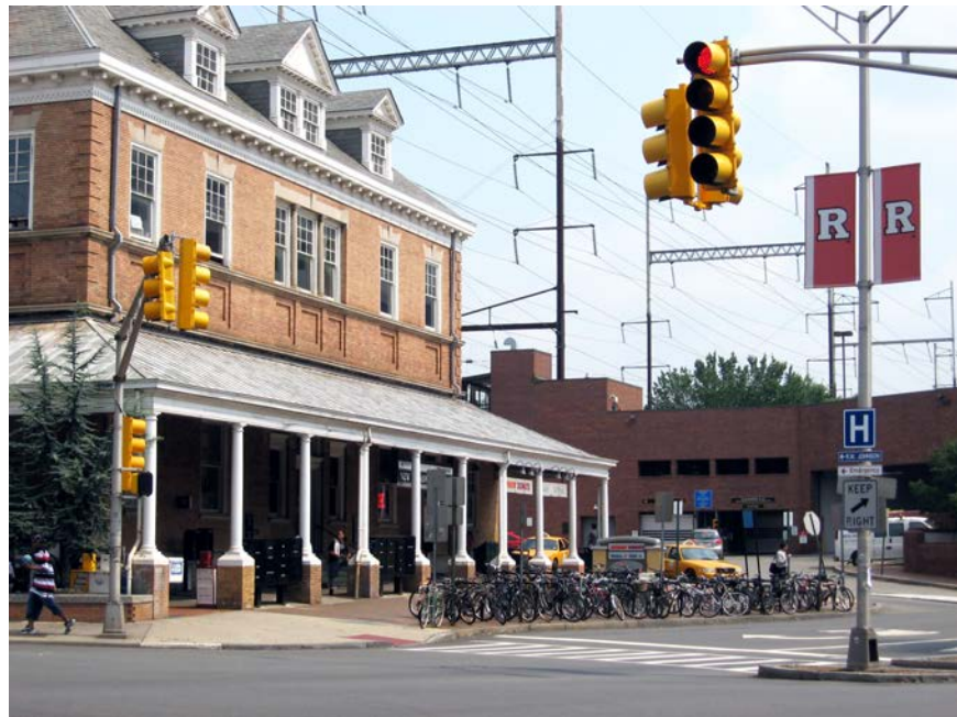
New Brunswick, NJ

For more information on their latest activities, please click here .