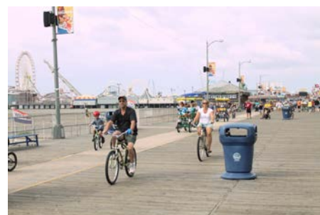
Bicycling on Wildwood's boardwalk

The Jersey Shore is a haven to some of the most scenic bicycling in the state. From Belmar to Seaside Heights, Long Beach Island to Ocean City, and as far south as Wildwood, there are boardwalks, bicycle lanes and bicycle parking to be used. In this article we'll look at some of the rules for bicycling on each town's boardwalk, any bike rentals in the area, and some of the bicycle facilities or amenities.