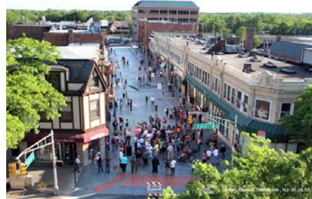
Somerville's pedestrian street

between stores have also created a less competitive and welcoming environment for everyone. The new street design allows for special events and activities to be held, including movie nights and farmer's markets.