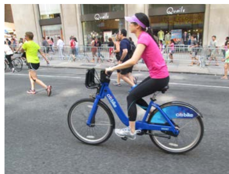
Citi Bike NYC user

Jersey City has announced the much-anticipated launch of its bicycle share program, Citi Bike Jersey City . Slated to open in September, Citi Bike Jersey City will be interoperable with New York City's bicycle share, Citi Bike NYC: only one membership is required to use both systems. Both programs will have the same fee structure, with riders having the option of a 24-hour pass, a 7-day pass or an annual membership. Jersey City will get 350 bikes and 35 stations this September. To celebrate the expansion, any new members who join by August 31 get $25 off!