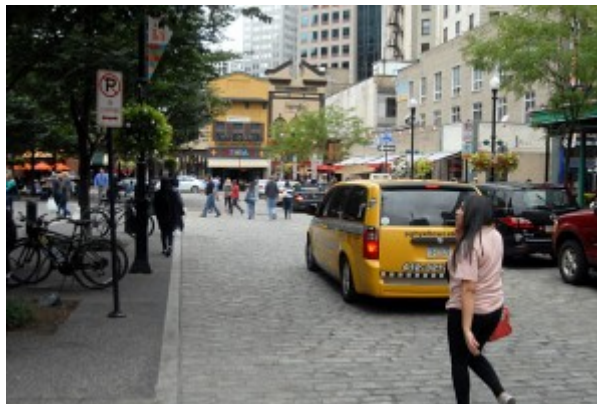
Shared Space at Market Square in Pittsburgh, PA

Although both Shared Space and Complete Street strategies share the same goal of protecting bicyclists and pedestrians while accommodating all users of the road, the tactics to achieve those ends vary.