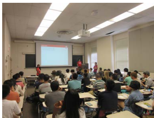
BPRC welcomes new Rutgers international students at the Bicycle Orientation

The Rutgers International Student Orientation helps new Rutgers students from all over the world familiarize themselves with their new environment before the domestic students arrive on campus. A major part of this week-long process is an array of orientations and workshops. On August 27, 2015, representatives from the New Jersey Bicycle and Pedestrian Resource Center hosted a Bicycling Workshop. The session was held in a classroom at Murray Hall, located on the College Avenue Campus.