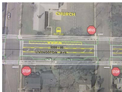
One of the proposed alternatives for Livingston Avenue

On August 18, 2015, the City of New Brunswick, Middlesex County, and Dewberry Consulting held a public forum on proposed changes to Livingston Avenue. This was the second public meeting on the project, which proposes to make Livingston Avenue safer for pedestrians, bicyclists, and motorists. The 60-foot-wide corridor