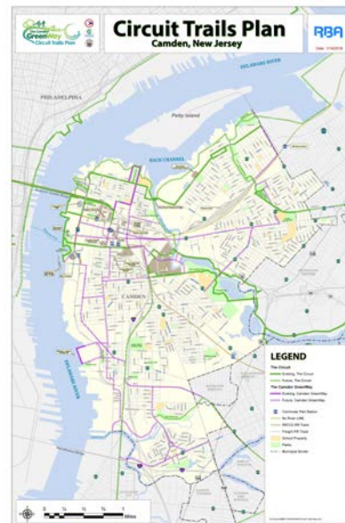
Circuit Trails Plan of Camden, NJ

Camden City recently completed the Camden Circuit Trails Plan, thanks to the New Jersey Department of Transportation (NJDOT) Office of Bicycle and Pedestrian Programs Local Technical Assistance Program (LTA) . This plan, managed by Coopers Ferry Partnership , was used to update the Camden portion of the 2010 GreenWay Trail Location Study showing all new construction and restoration of "trails." This refers to designated bicycle and pedestrian facilities, both on and off road.