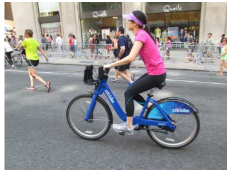
New York City bike share (Citi Bike) user // Alan M. Voorhees Transportation Center

The Mineta Transportation Institute released a fascinating new study in March, " Bikesharing and Bicycle Safety ," that shows that using bike share is safer than riding a personal bike. Most striking, there have been zero fatalities in the United States among the over 90 bicycle share systems , compared to the national general bicycling fatality rate of 21 per 100,000,000 trips. The authors also analyzed the crash and ridership statistics from three bicycle share systems: Washington, D.C. (Capital Bike Share), Minneapolis-St. Paul (Nice Ride Minnesota), and San Francisco (Bay Area Bike Share). Capital Bike Share had the highest rate of crashes of the three bike shares, yet it was still just 65% of the national bicycle crash rate. Read the full article to find out why: