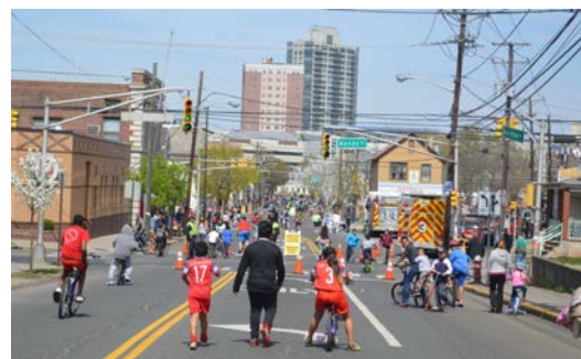
Participants enjoying New Brunswick's Ciclovía

Pedestrians will be free to run, bike, walk, skate, dance, or amble the Ciclovía route between 11:00 AM and 4:00 PM. Read more about the New Brunswick Ciclovía here .