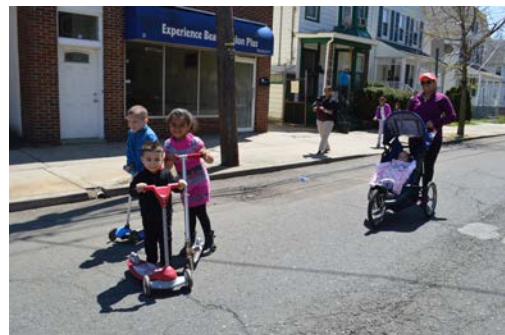
Participants at the New Brunswick Ciclovía, April 24, 2016 // Alan M. Voorhees Transportation Center

The New Brunswick Ciclovía, New Jersey's first ever Ciclovía hosted back in 2013, began its fourth year with a bang, with a new route and new activities. Held on April 24th, 2016 between 11:00 AM and 4:00 PM, the route ran in front of the City Hall on Bayard Street for the first time. New activities included a petting zoo for children. If you couldn't make it, make sure to put June 25th on your calendar for your next opportunity to enjoy the open streets. Check out some of our favorite photos!