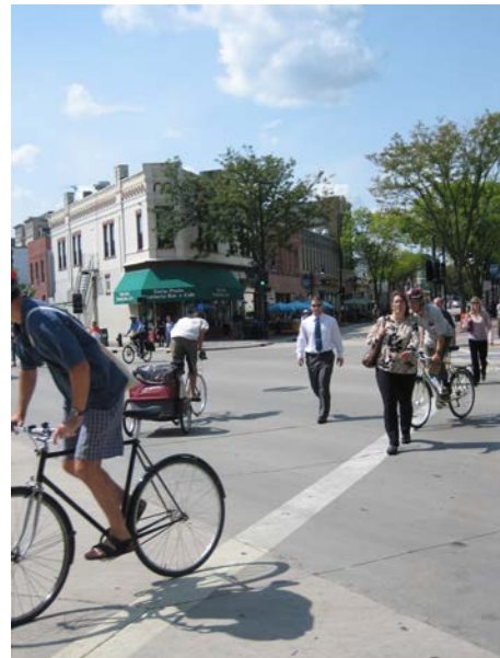
Bicycling and walking // Alan M. Voorhees Transportation Center

The Federal Highway Administration (FHWA) published a new guidebook to help communities develop performance measures for bicycle and pedestrian planning in March 2016, Guidebook For Developing Pedestrian & Bicycle Performance Measures . This guidebook discusses key steps that communities can take to develop performance measures that fully integrate pedestrian and bicycle planning into broader, ongoing performance management efforts.