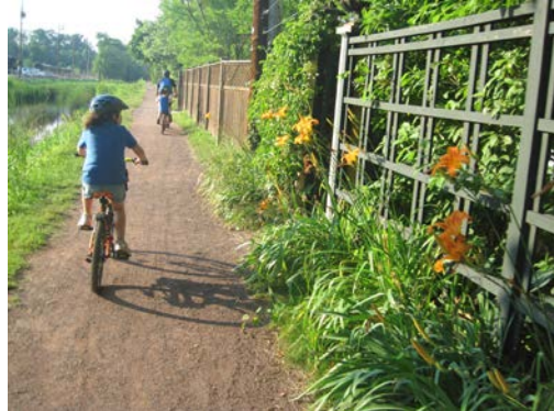
Bicycling in the spring time on New Jersey's Delaware-Raritan Canal Path

Spring is officially here! Now that freezing temperatures, snow, and shorter days are behind us, it is a great time to go for a bicycle ride. However, if your bicycle has been neglected during the winter months, it is important to make sure everything is working properly before riding. Read the article to find out how to get your bicycle into riding shape, as well as upcoming events in celebration of National Bike Month.