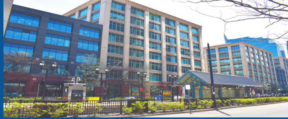
TRANSIT AREA DEVELOPMENT