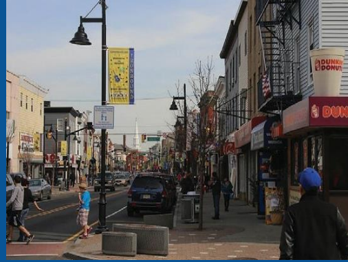
MIX OF USES NEAR TRANSIT