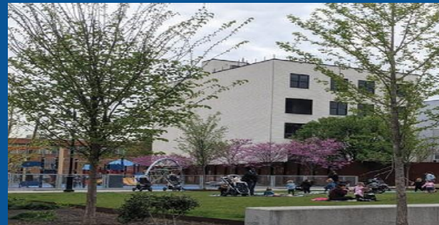
HIGH QUALITY PUBLIC SPACE