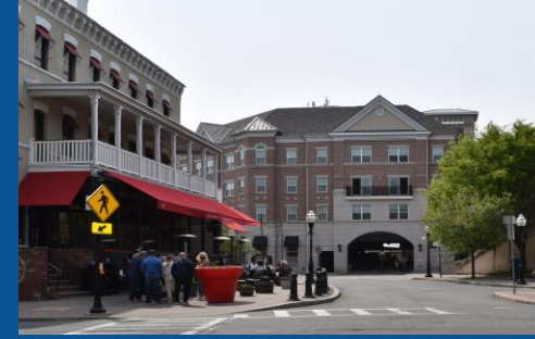
RIGHT-SIZED PARKING FACILITIES