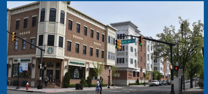
RESIDENTIAL DENSITY AND A MIX OF HOUSING