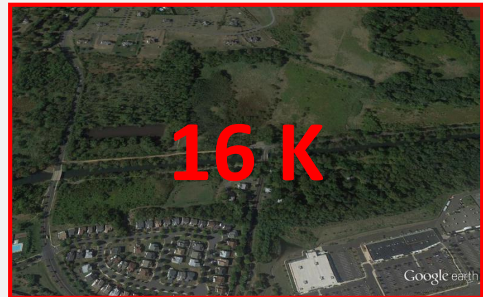
Port Mercer Canal House – D&R Trail