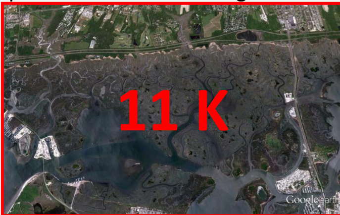
Cape Island Wildlife Management Area