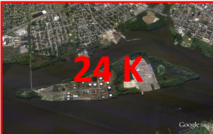
Pettys Island - Pennsauken