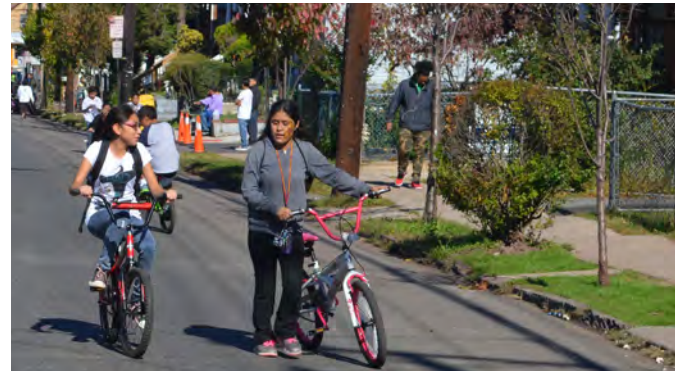
New Brunswick, NJ

This conference serves several purposes. It will both benchmark and celebrate efforts by New Jersey's state and local governments to improve the safety and attractiveness of our public roads for all users of all abilities. In addition, the Summit will provide a wealth of information about design principles and financing mechanisms to help communities move from adopting Complete Streets policies to implementing Complete Streets projects. Finally, this Summit will highlight the economic, public health, and mobility benefits of Complete Streets. Implementing a Complete Streets program can be difficult, and understanding these benefits will equip planners, engineers, and policy-makers to better advance the case for Complete Streets in their communities.