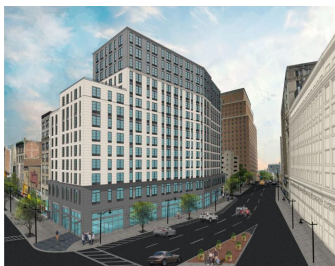
Newark Council OK's Transit Village Proposal for 'Four Corners'