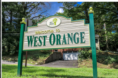
West Orange Council Addresses Pedestrian Safety