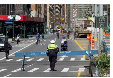
NYC Launches Pilot Program, Closes Streets for Ped Use to Support Social Distancing