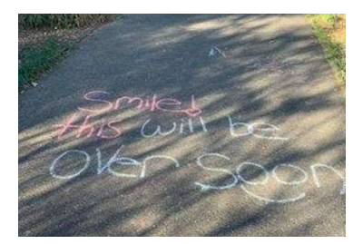
More Sidewalk Art Cheers Hawthorne Pedestrians