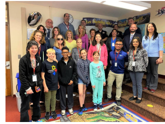
Two More West Orange Schools Receive Safe Streets to School Recognition