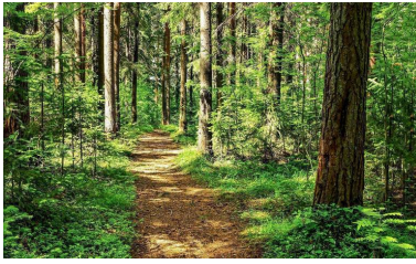
Take a Walk or Bike on the Nature Side: 20 miles of New Trails Coming to BurlCo