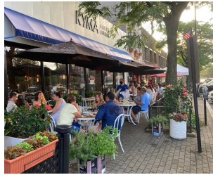
Curbside Dining in Somerville Inches Closer To Main Street