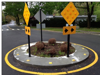
Asbury Park Announces 'Design of Traffic Calming Measures'