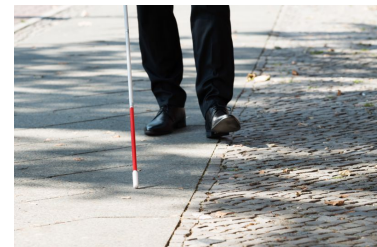
NYC intersections violate ADA by lacking enough audible signals for the blind, judge rules