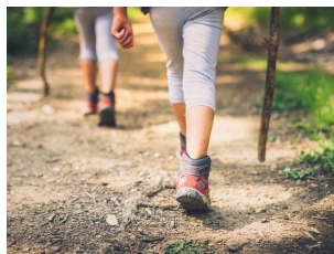
Camden County Receives $4.4 million for LINK Trail