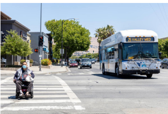
Sharing the Road: Safer Streets Means Safe for