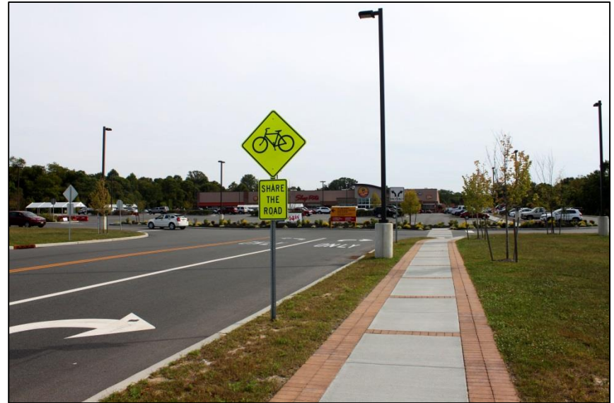
Vineland, Cumberland County