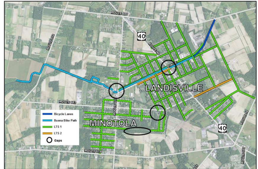
Buena Borough, Atlantic County