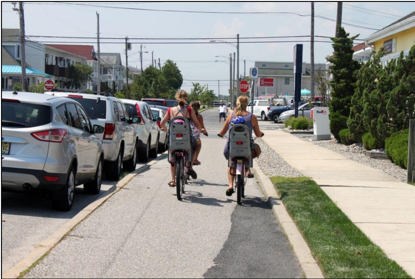
Ocean City, Cape May County