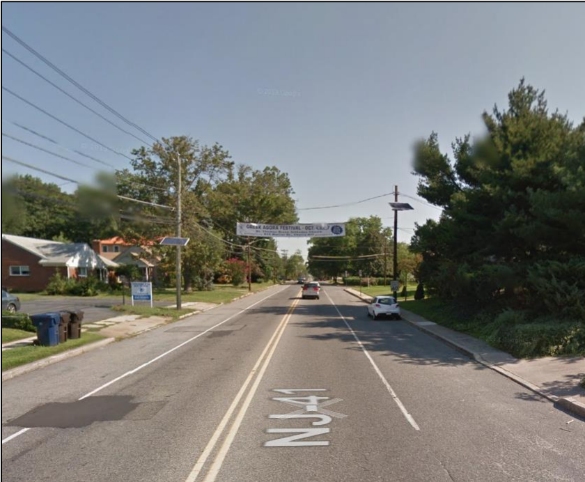
Before : Kings Highway, Cherry Hill Township, Camden County