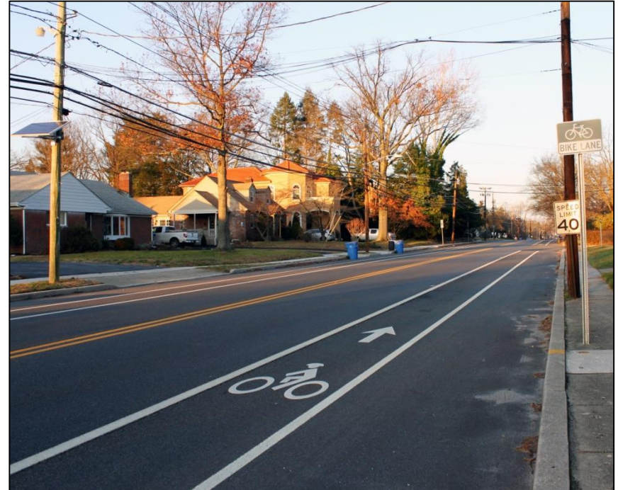
After : Kings Highway, Cherry Hill Township, Camden County