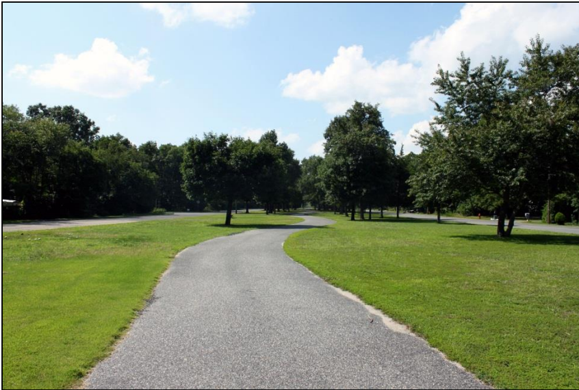
Woodbine, Cape May County