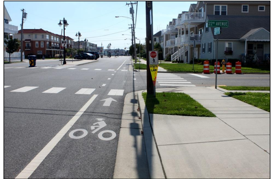
North Wildwood, Cape May County