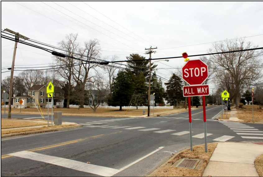
Hammonton, Atlantic County