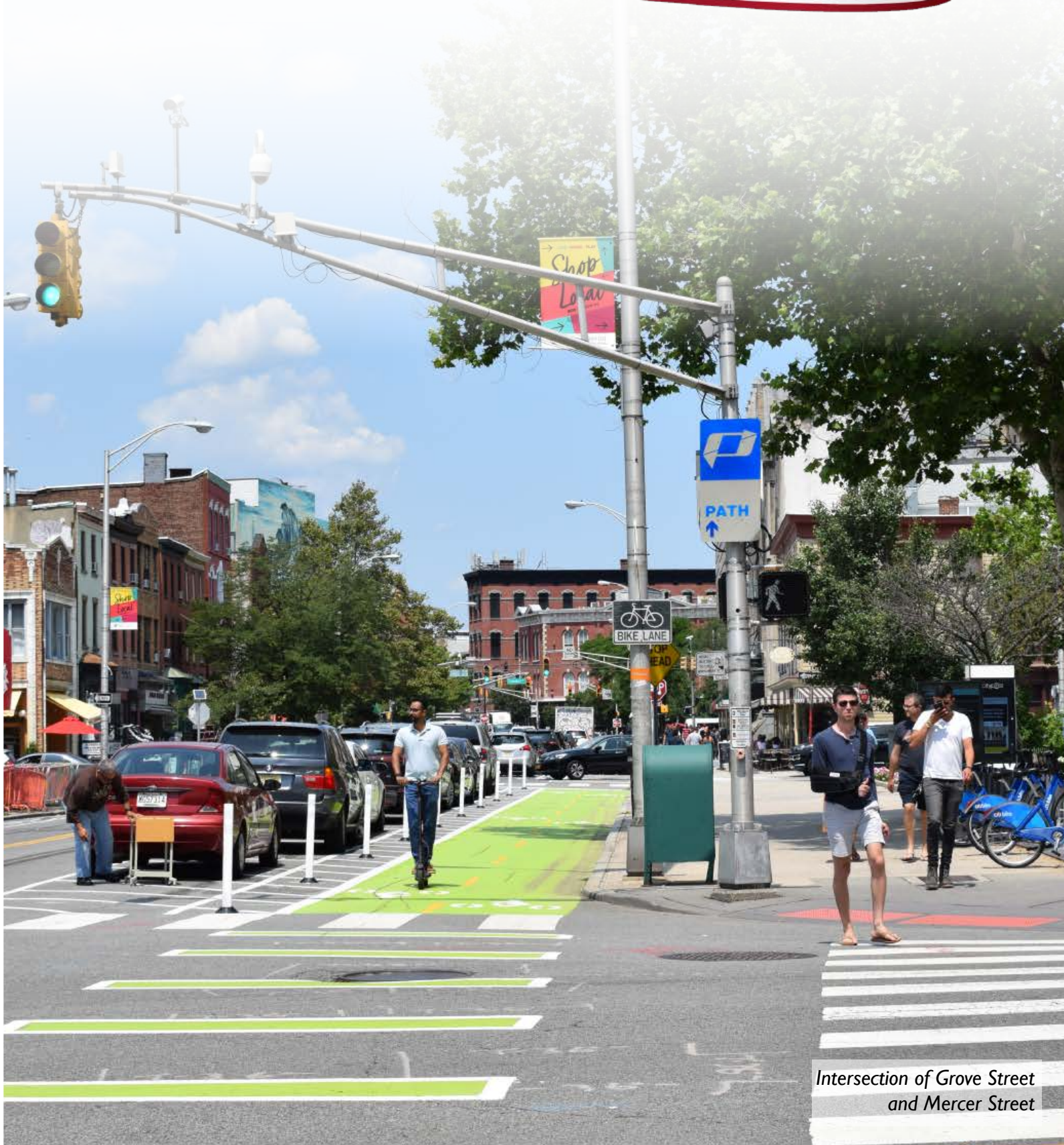
Intersection of Grove Street and Mercer Street