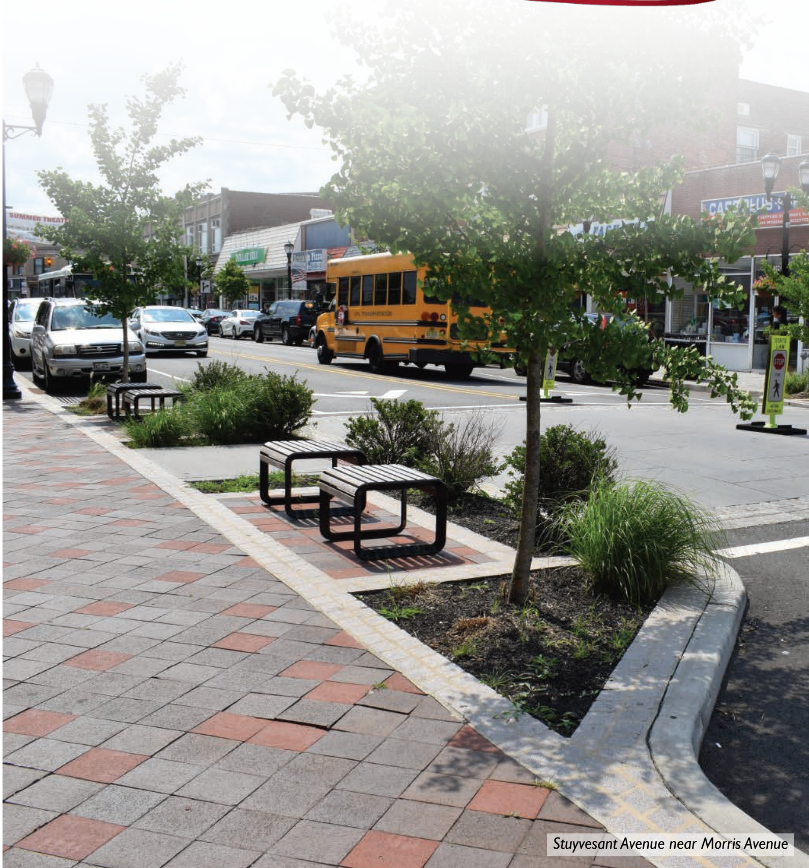
Stuyvesant Avenue near Morris Avenue