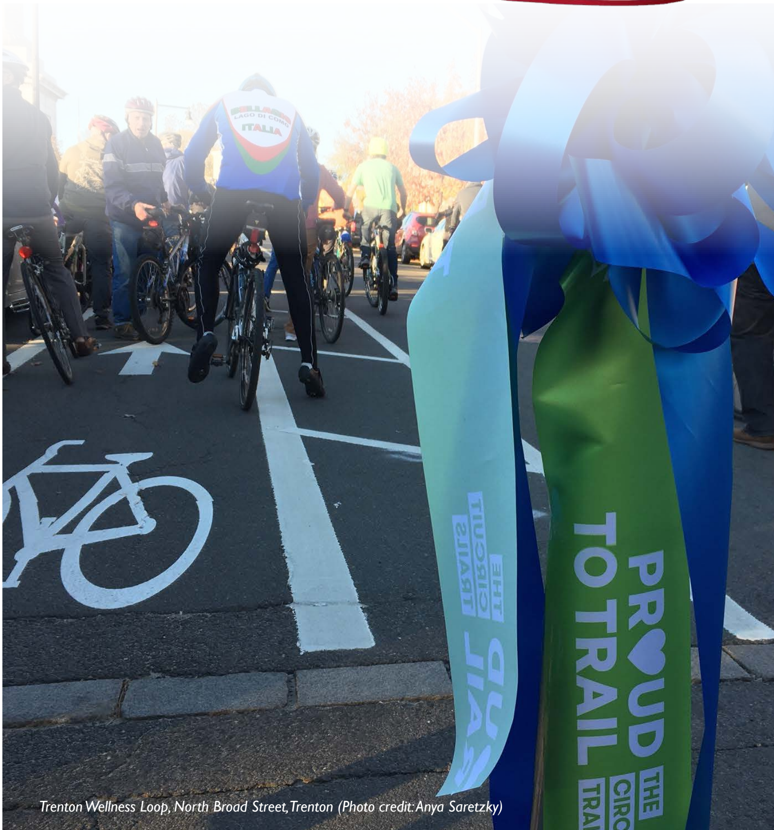
Trenton Wellness Loop, North Broad Street, Trenton