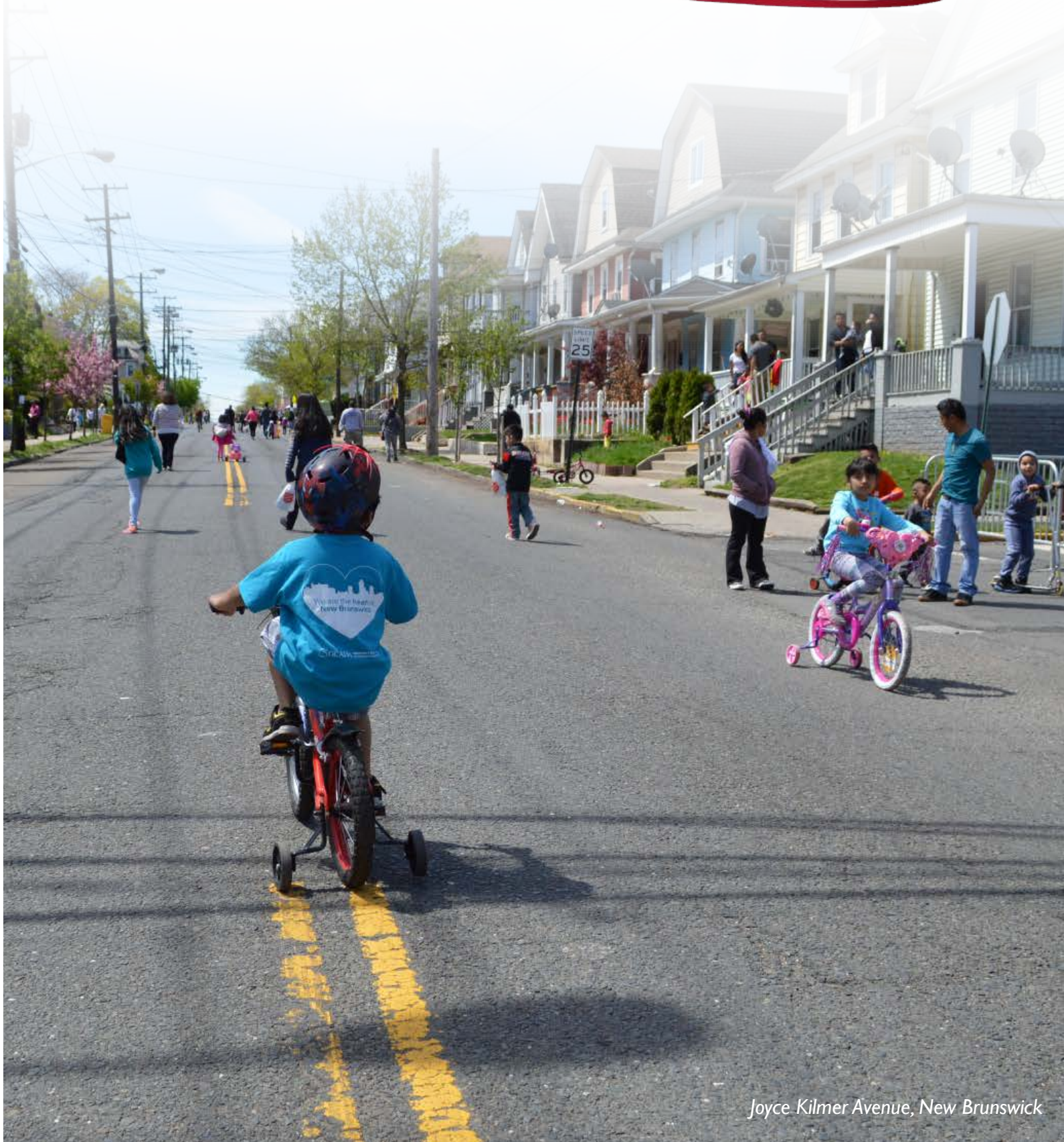
Joyce Kilmer Avenue, New Brunswick