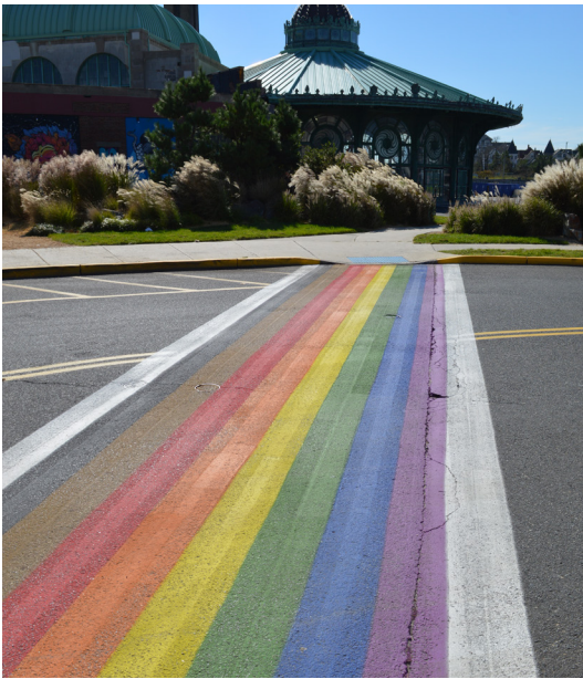
Figure 7. Rainbow Crosswalk, Asbury Park, NJ

TU can also be used to enliven pedestrian safety infrastructure. For example, the generic white-striped