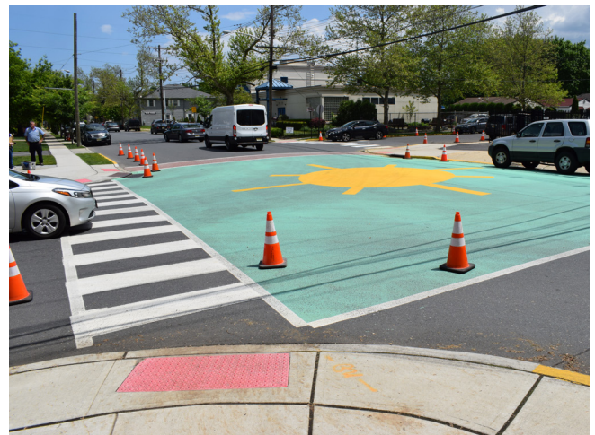
Figure 16. Intersection installation prior to placement of traffic cones.