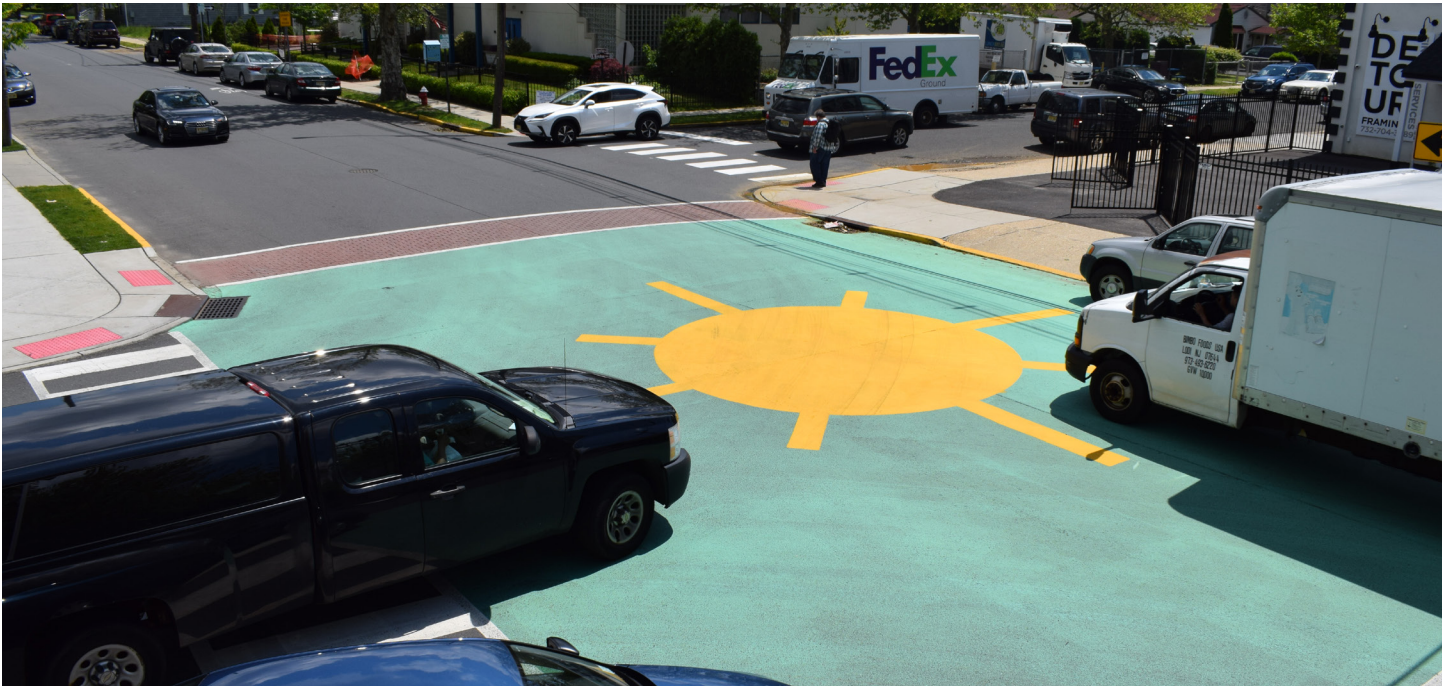
Figure 15. The offset design of the intersection makes it challenging for vehicles to navigate even without the presence of pedestrians. This photo was taken after the mural was painted, but before the cones were set in to limit the width of the travel lanes.

The intersection of Drs. James Parker Boulevard and South Bridge Avenue was identified by local police and crash statistics as a problem area known for high traffic counts, dangerous driving, and speeding. Three marked crosswalks were located at the intersection, two crossing South Bridge Avenue and one crossing the eastern side of Drs. James Parker Boulevard (Figure 13). The crosswalk over Drs. James Parker Boulevard at the eastern end and western end of the intersection was not marked. Sightlines are an issue for cars turning into pedestrian crossings at the intersection, particularly because of the offset layout of the intersection.