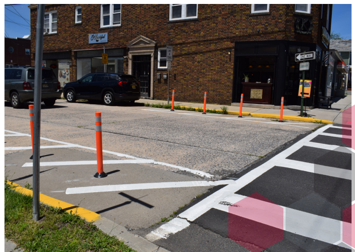
Figure 19. Plastic bollards and paint reinforce no parking near the intersection.