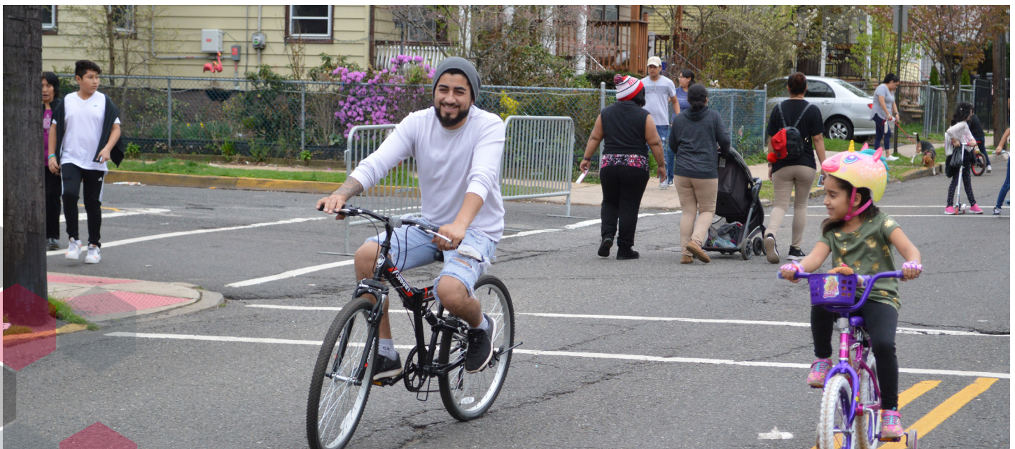
Figure 9. New Brunswick Ciclovía

This free nighttime festival transformed a forgotten and blighted urban space into a lively community gathering place. The former prison site, located in a low-income part of the city, was situated in a prime location along Camden's waterfront at the foot of the Benjamin Franklin Bridge. Community development groups within the city saw the location's potential, especially given the beautiful nighttime skyline views across the Delaware River. Camden Night Gardens was established to celebrate the community's rich history, diverse culture, and wealth of artistic talent (Figure 9). The first Camden Night Gardens event hosted approximately 3,000 attendees. The temporary event allowed residents and city officials to witness the potential for the site. Today, the site has been transformed with permanent solutions and is home to a beautiful waterfront pathway and a large playground. The Camden Night Gardens was a temporary solution that inspired lasting change allowing the abandoned property to be permanently transformed into a valuable community asset.