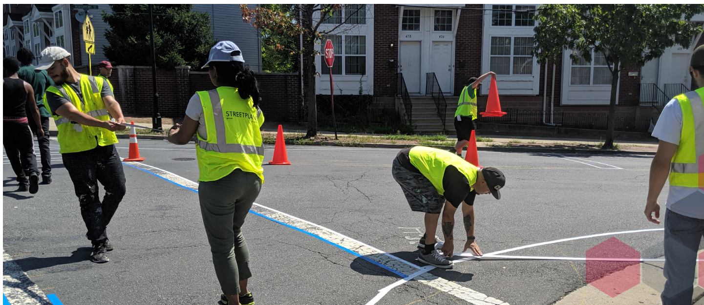
Figure 10. Volunteers laying tape in preparation for the crosswalk and mural painting the next day.

For this project, two intersections were selected along Brunswick Avenue near the Martin Luther King Jr. Elementary School in the City of Trenton. The TU project was guided by the Trenton Health Team,