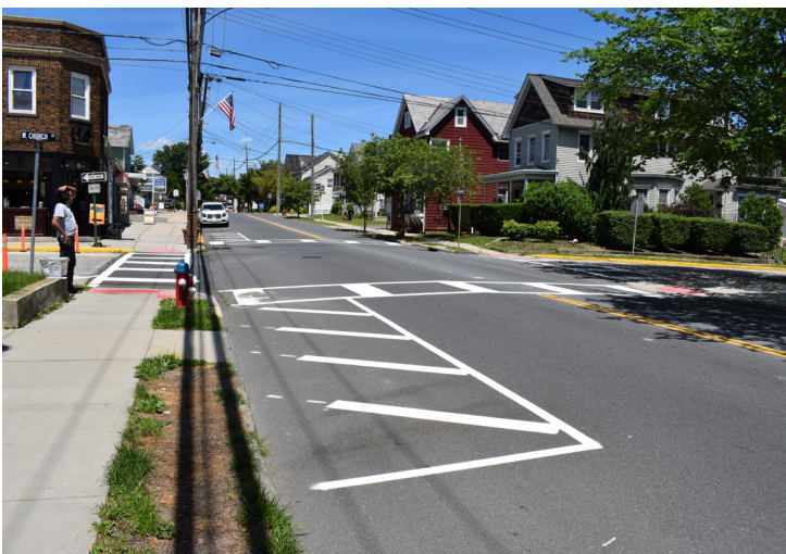
Figure 18. A photo taken after project implementation at the intersection.

Main Street is a two-lane road, which hosts a mix of residential and commercial uses and bisects the center of town. Main Street is an important connector which links Milltown to US Route 1 and Ryders Lane and is