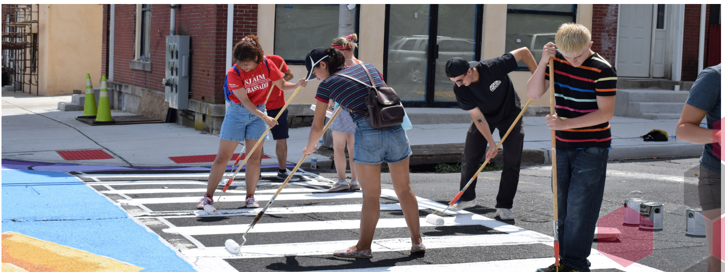
Figure 3. Volunteers painting a crosswalk, Trenton, New Jersey

TU projects take the debate from hypothetical scenarios on a drawing board to real world streets. They allow community members to participate in an important process. First, they experience the challenges of an area, such as difficulty crossing a street due to speeding traffic. Then, they have an opportunity to provide ideas through brainstorming, which can take place through community meetings and workshops, and participate in the project development and implementation. This allows community members to incorporate local culture in the final product, which is especially powerful for TU projects that incorporate artwork. In Figure 3, volunteers can be seen painting crosswalks in Trenton. The mural in the center of the intersection was designed by a local artist and incorporates the area's cultural diversity and connections with Dr. Martin Luther King, Jr. Finally, community members can experience and evaluate the temporary solution and suggest adjustments before deciding if a permanent solution is needed.