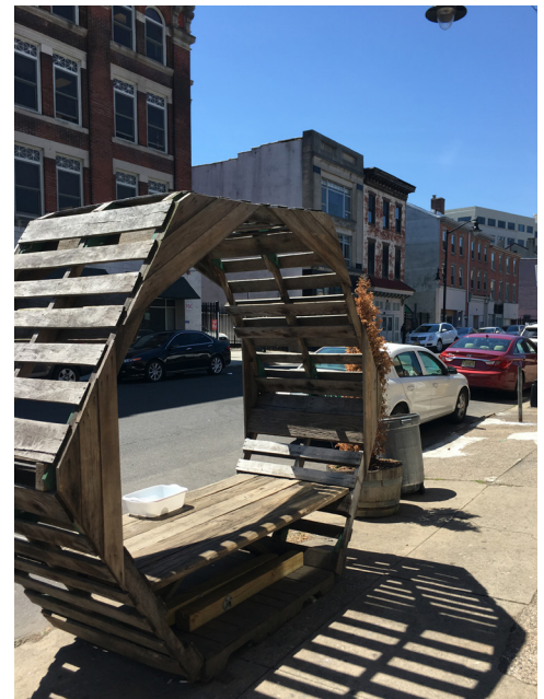
Figure 2. Parklet, Trenton, New Jersey

By creating a more welcoming environment for pedestrians, TU projects can spur economic development. In fact, in the Division Street example detailed above, retail vacancies along the street went from 50 percent vacant in the years leading up to the new plaza to 100 percent occupied after the plaza was opened solely to pedestrians. 2 But TU projects do not have to drastically change a corridor in order to be successful. With the simple addition of a parklet, restaurants and cafes can increase their seating area and benefit from a boost in customers.