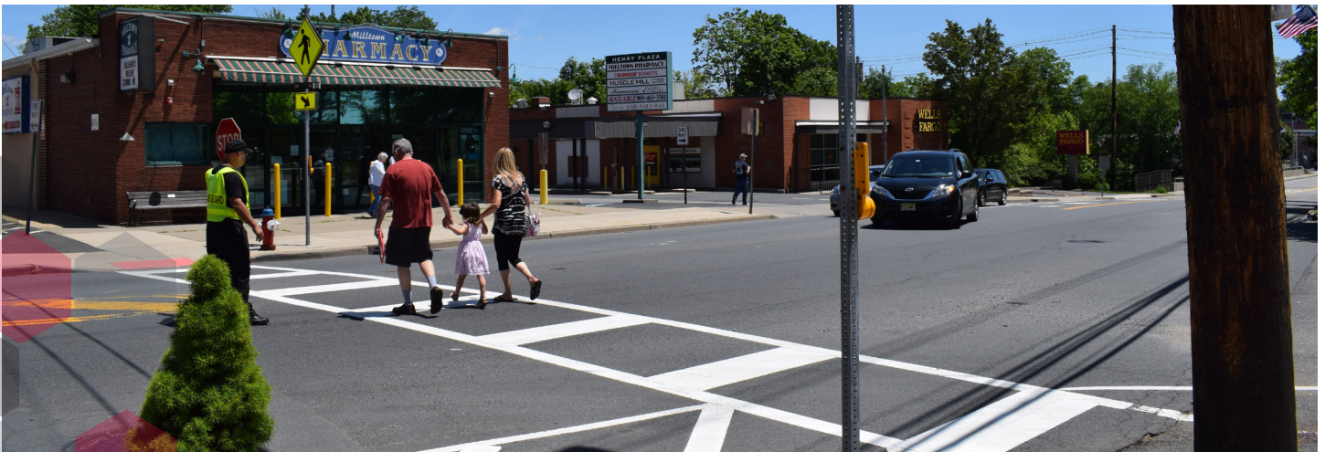
Figure 20. High visibility ladder crosswalks.

Overall, respondents provided positive feedback regarding the changes and asserted that the project improved the attractiveness of the intersection. However, around 30 percent of respondents stated that they did not notice the changes and did not agree that the changes made the intersection attractive.