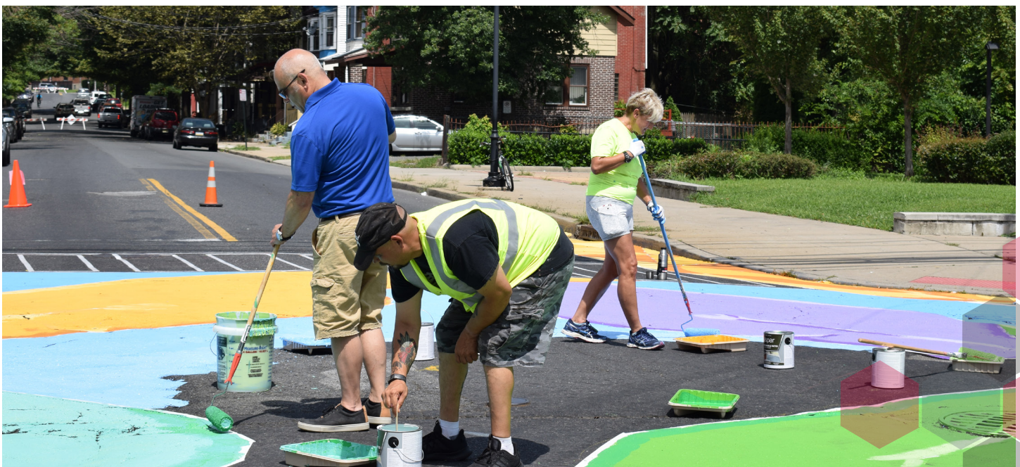
Figure 13. Volunteers painting the mural at the intersection of Southard Street and Brunswick Avenue.

After the TU project was finished, residents were given a few weeks to experience the changes. Then, a team of Ambassadors in Motion from the Alan M. Voorhees Transportation Center visited both intersections and conducted intercept surveys. The surveys were used to gather input on the project