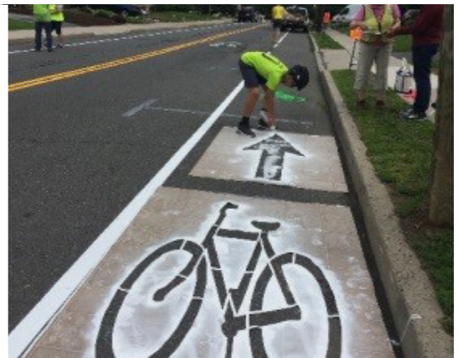
Figure 5. Volunteers painting temporary bicycle lanes in Princeton, New Jersey