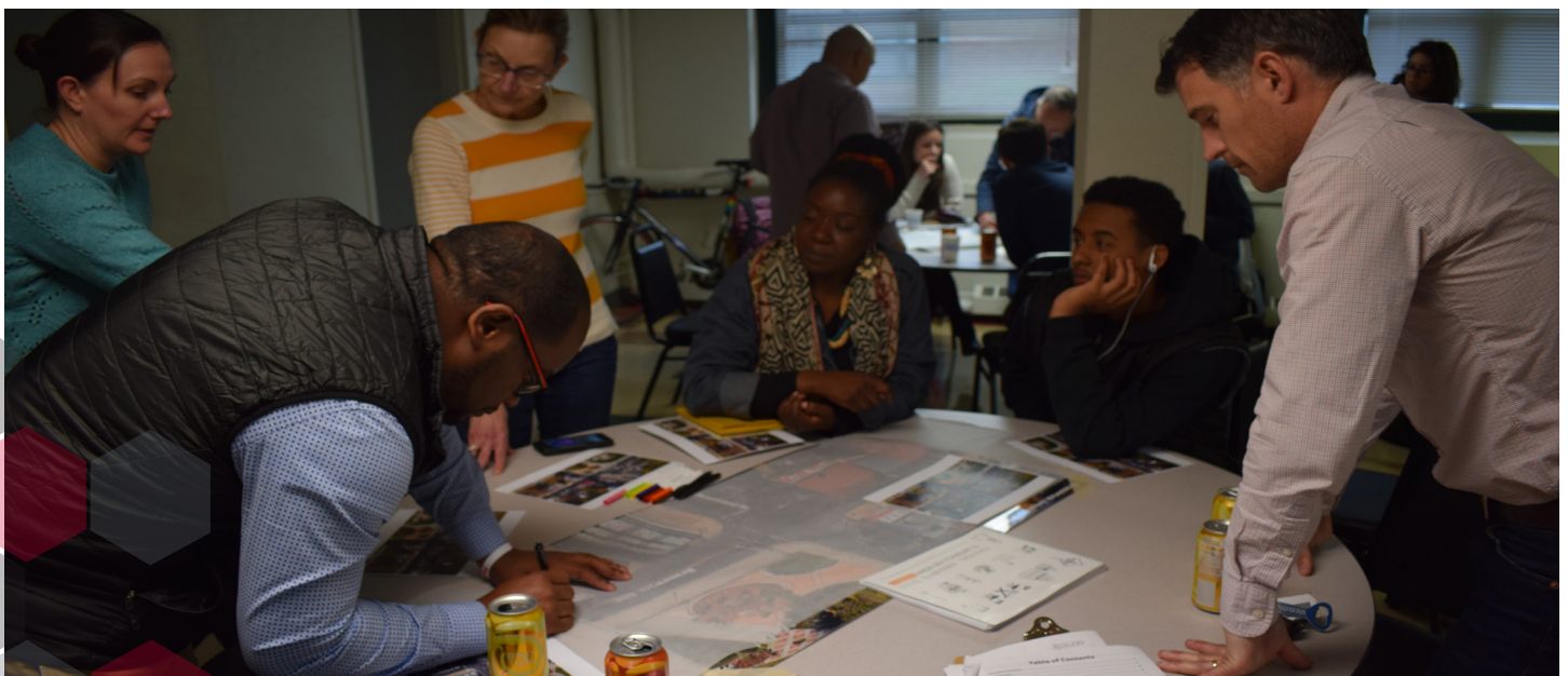
Figure 11. A workshop with community members to identify and brainstorm solutions on safety concerns.

Stakeholders were invited to participate in a TU workshop hosted by the Trenton Health Team. Through the workshop, local community members and leaders learned about pedestrian and roadway safety and the ways in which it could be enhanced through roadway design and TU projects. The presentation included examples of TU projects from around the country to help spur conversations and get participants thinking. After the presentation, participants gathered in groups. On each table, a large map was printed out of one of the two intersections and participants were invited to brainstorm ways in which safety at the intersection could be improved. Participants were then able to draw their ideas on the enlarged maps (Figure 12). After discussions with the larger group, consultants took the maps back to their office