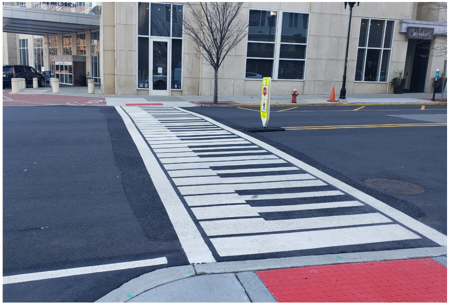
Figure 8. Piano crosswalk, New Brunswick, New Jersey

crosswalks have been transformed into colorful and creative pieces of artwork that speak to the local community's identity. Artwork along crosswalks can provide an excellent opportunity to engage the community as they can provide input or take the lead on reshaping their own street space with interesting patterns and colors. The bright or striking patterns also enhance the visibility of pedestrians in the crosswalk and improve pedestrian safety. Below are two examples of creative crosswalks installed in New Jersey.