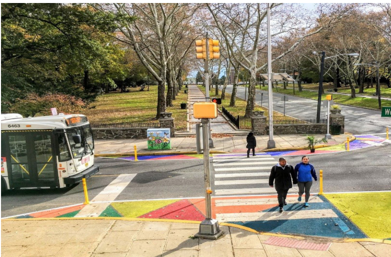
Figure 4. Painted Curb in Jersey City, New Jersey.

Successful TU projects are identified as low risk with high returns, which inspires communities to think about their local challenges and brainstorm ideas to address them. Some examples of TU include installing bollards or painting crosswalks and curbs for pedestrian safety and using art to improve the aesthetics of an area. There are a variety of examples of TU projects of all shapes and sizes. After all, the best TU projects are those that are shaped to fit the unique needs and characteristics of a specific community. The following projects provide a small sampling of solutions developed through TU.