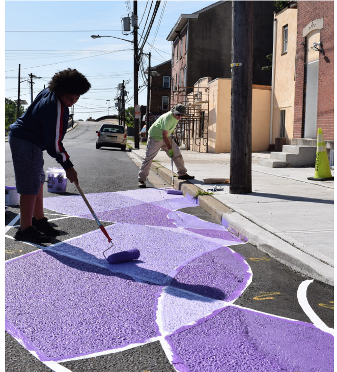
Figure 12. Volunteers painting the intersection.

Volunteers of all ages were invited to come paint the streets (Figure 13). Announcements inviting volunteers to the painting day event were posted around the city and on social media. Various local organizations' also helped spread the word through their regular community outreach methods. It was a unique opportunity for residents to help beautify their neighborhood and several dozen volunteers came out to help.