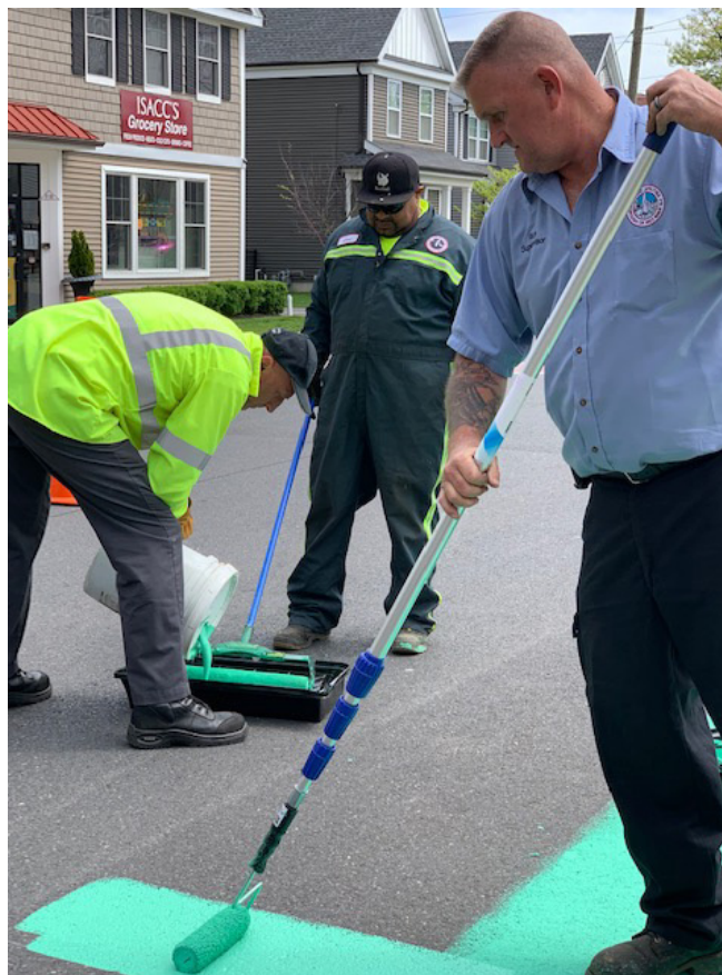
Figure 14. Municipal employees installing the project.

Two locations were also selected in Red Bank for temporary improvements under the NJTPA Complete Streets Technical Assistance program. Here, we will discuss just one of the projects, the upgrades installed at the intersection of Drs. James Parker Boulevard and South Bridge Avenue.