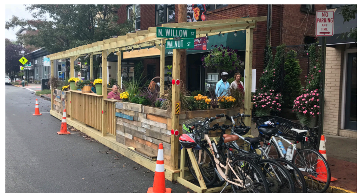
Figure 6. Parklets, Montclair, New Jersey

Volunteers, equipped with 16,000 feet of tape, dozens of cans of white spray paint, and several laminated signs, installed 5-foot wide bike lanes along Hamilton Avenue and Wiggins Street, a corridor spanning two grade schools and a public library. The intervention lasted 10 days; meanwhile, the municipality eliminated on-street parking to create space for bicyclists and encourage K-12 students to bike to school.