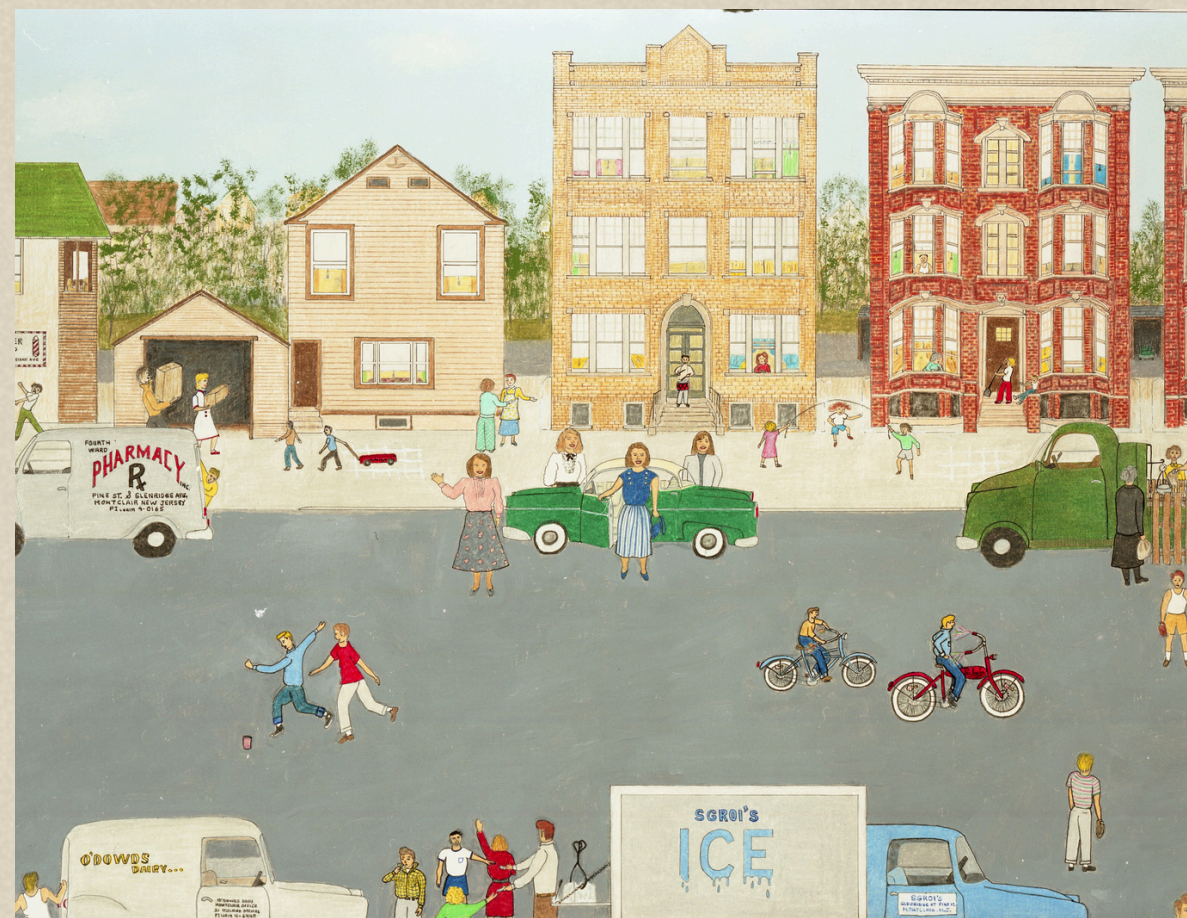
PINE STREET THEN 1 BY VINCEDNT TANGO FROM THE MONTCLAIR HISTORY CENTER COLLECTION

IT'S NOT THE CURBS, STRIPING, AND TRAFFIC SIGNALS THAT COMPLETE A STREET, IT'S THE CONSIDERATION OF ALL THOSE WHO USE THE STREET, NOT JUST THE CARS.